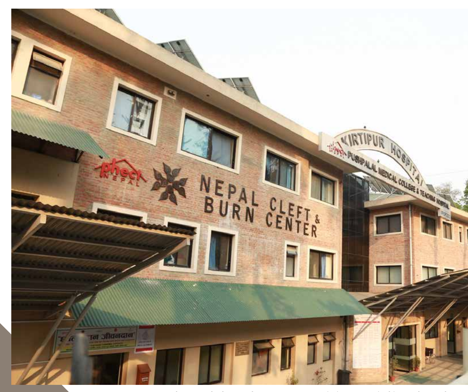
The Nepal Cleft and Burn Center at Kirtipur Hospital in Kathmandu